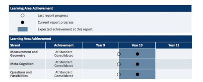
Semester One Reports 2019

If you have any questions about the Semester One reports, please feel free to contact a member of the Learning & Teaching Team at the College.