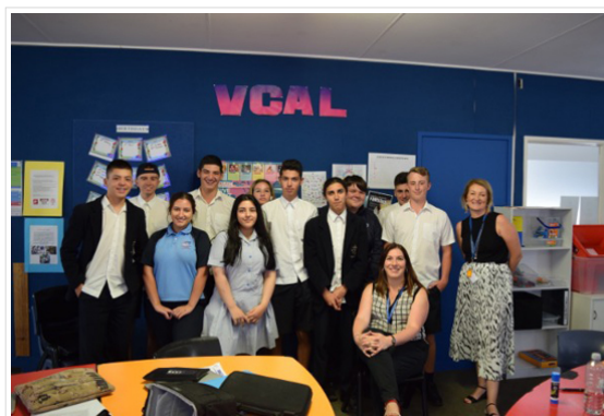
VCAL Class and Presenter