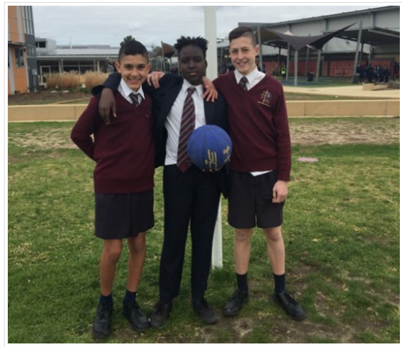
Year 8 Team