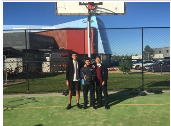
Year 10 Team