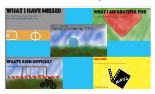
Luke N 7 Kulin