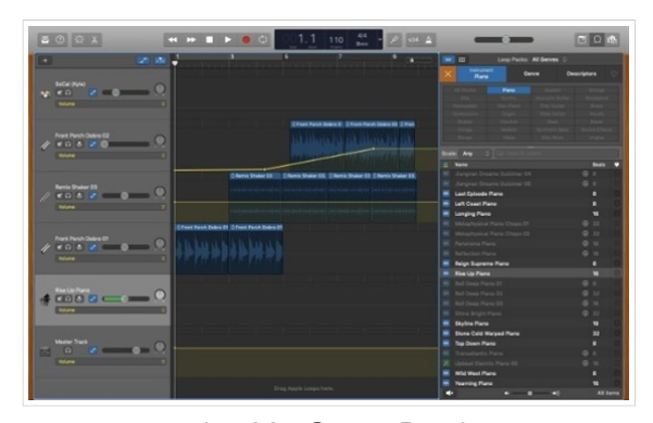
Ava M - GarageBand

https://drive.google.com/file/d/16GWplwp2P89zI7xCzTNMgS 2HxnqadguG/view?usp=sharing