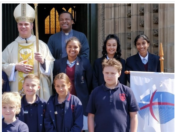
St Patrick's Mass & Youth Colloquium