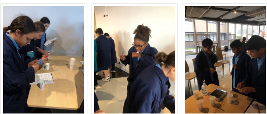
Year 7 Science Mixtures- Sherbet in the making