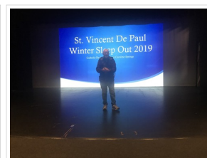
Social Justice – Winter Sleepout