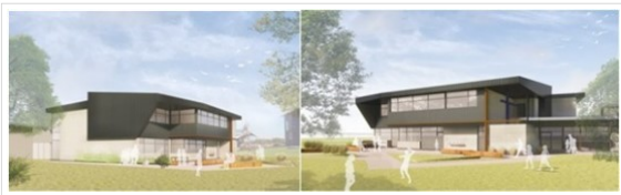
Year 9 Learning Centre

A new Performing Arts Centre and Cafeteria as well as the 10 modular general-purpose classrooms building is now completed, and this has been a great inclusion for our community and the students are now reaping the rewards of these state of the art facilities. This modular building named the Siena building provides the growing population of students the opportunity to ensure all classes are housed in appropriate classrooms and enables better use of general-purpose and specialist facilities, whilst freeing up other learning spaces to be better utilised. These new facilities provide a rich and stimulating learning environment for all our students to flourish and reach their full potential