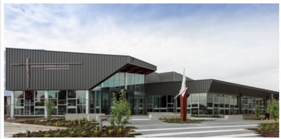
Performing Arts Centre

Our striving for excellence in all we do will be supported by ongoing development and upgrading of College buildings, grounds and facilities. The College has employed a new architect firm, 'Clarke Hopkins Clarke' who are now overseeing the production of a new College master plan to be completed in 2019.