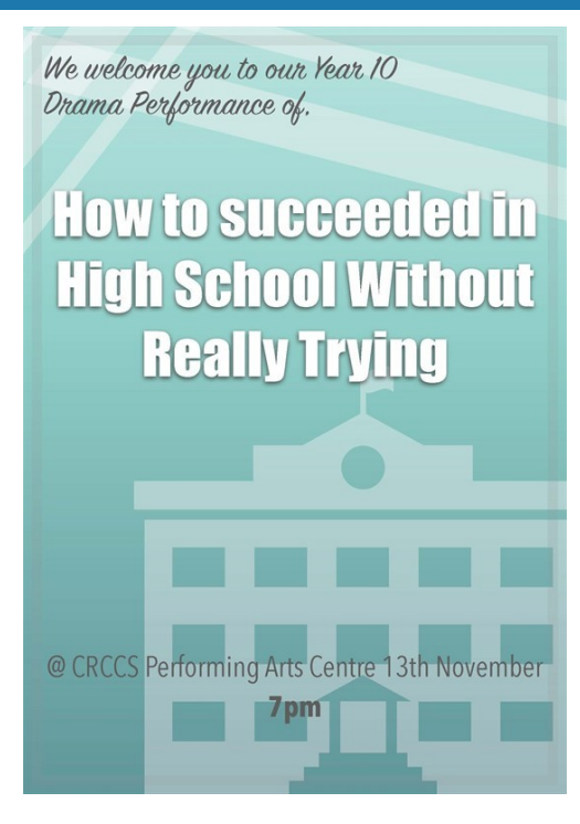
Year 10 Drama Performance Flyer