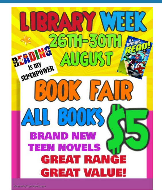
Book Fair 2019