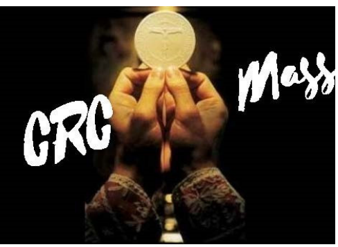
8am every Friday of School Term